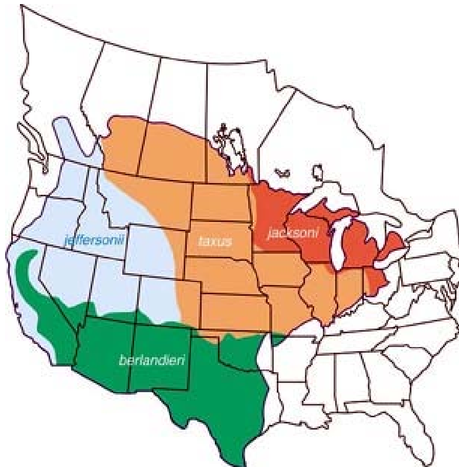
Figure 1. Approximate ranges of the four American Badger subspecies in North America

There is thought to be significant overlap in the ranges of subspecies, with intermediate forms occurring in the areas of overlap.